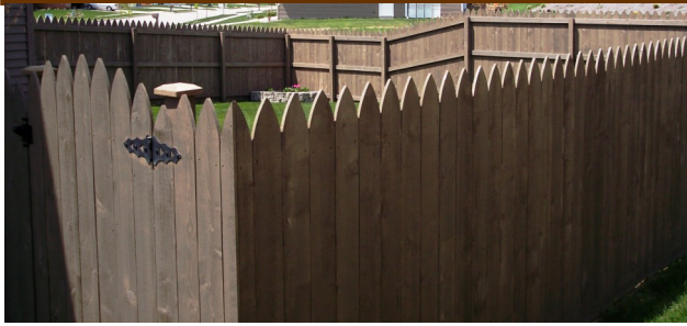
'[ '[ ¶ *RWKLF SLFNHW VROLG