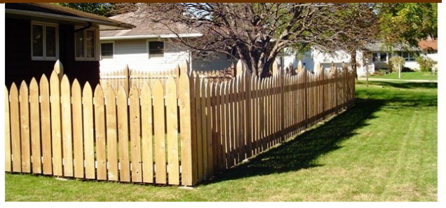
SDW[W H U Q * RWKLF SLFNHW FRQFDYH