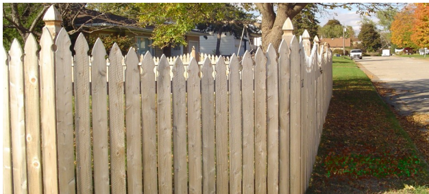
'[ '[ ¶ )UHQFK JRWKLF SLFNHW