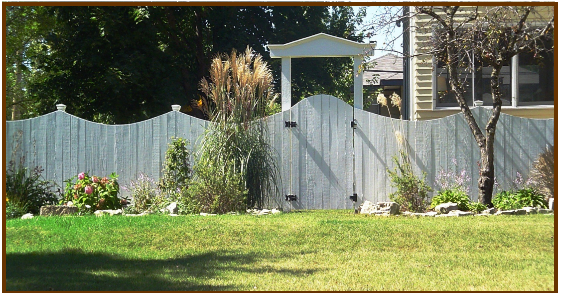
1" x 6" x 6' Concave top, solid pattern (stained)

There are many designs and picket styles to choose from. Picket style options are 1"x 4" & 1"x 6", with various cut options; Concave and Convex, Dog-ear, Flat, Gothic and French gothic. Please see the reverse side for a list of designs and picket styles available.