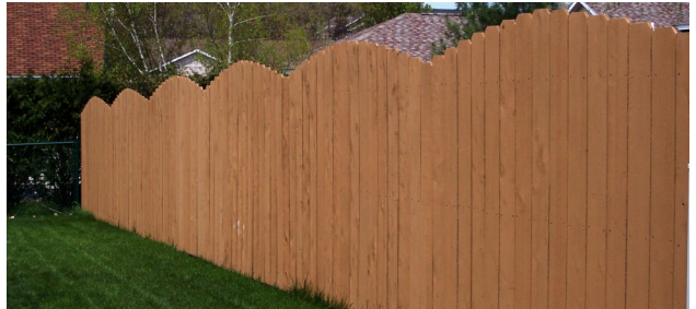
FRQFDYH ¶ H ¶ Z-Bar picket, solid pattern