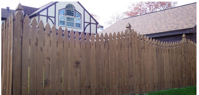
'[ S D W [ W H U Q * RWKLF SLFNHW FRQ