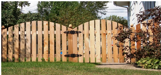
'[ '[ ¶ &RQYH[ FXW SLFNHW Z