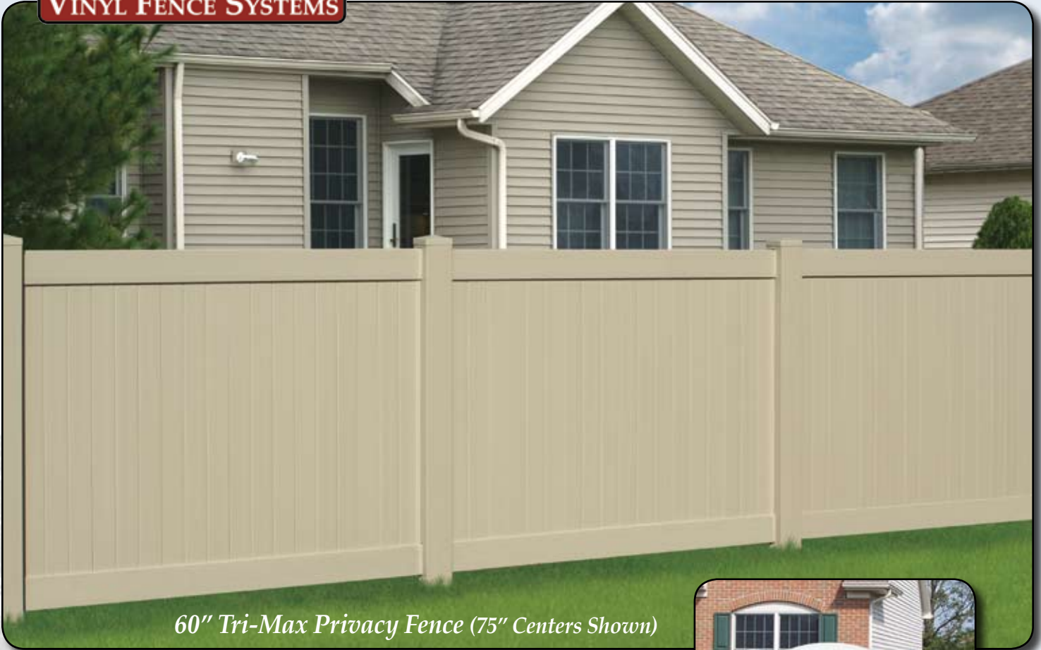
60" Tri-Max Privacy Fence (75" Centers Shown)