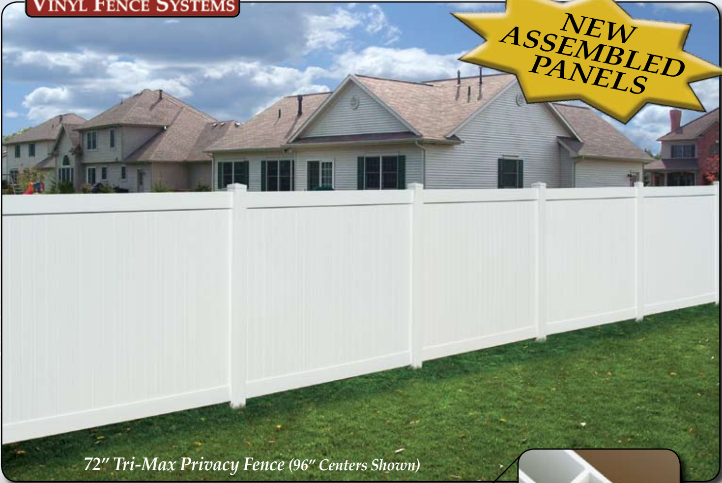
72" Tri-Max Privacy Fence (96" Centers Shown)